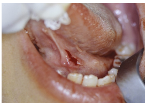
Figure 4: Removal of the sialolith and subsequent salivary flow.