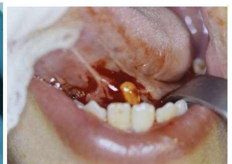
Figure 3: Incision of the mucosa over the sialolith.