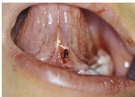
Figure 5: Suture of the surgical wound.