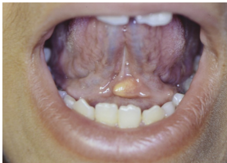
Figure 1: Sialolith located in the duct of the sublingual gland.

The suture was removed after 15 days. No post-surgical complaints or complications were reported. Satisfactory healing and normal salivary flow were observed. The patient has been followed with no signs of recurrence.