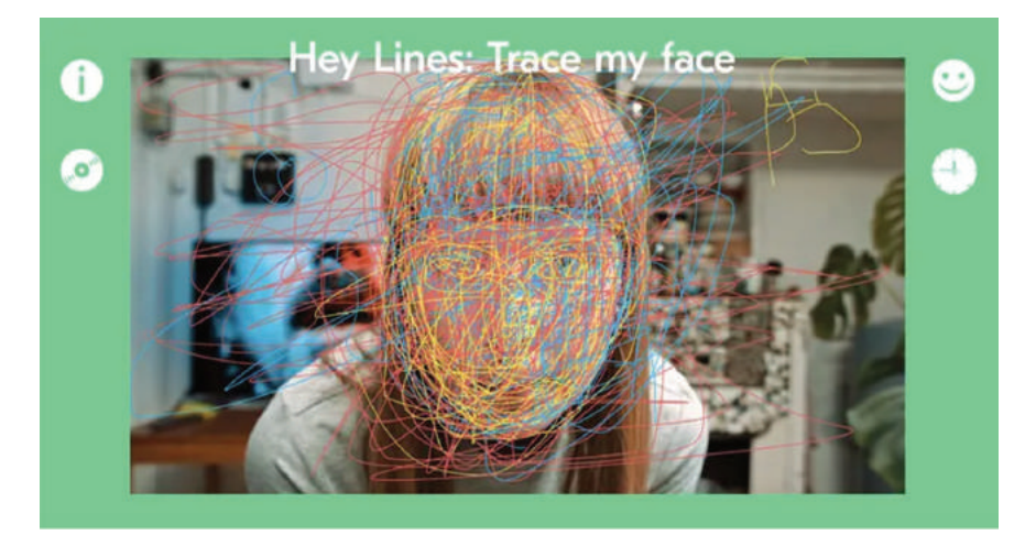
Studio Moniker and Studio Puckey: Out of Line, 2016 Interactive, crowd-sourced music video for Dead End by zZz, which invites viewers to add their own drawings and scribbles to the film.

When connecting the archives (digital books) to the 'readers': What are the contemporary modes of reading? To what extent is physical engagement part of the reading and gaining knowledge? What readers are involved and how to connect them to the content of the library, but also to each other (multi-generational and/or multi-cultural audiences)? How new digital, online, mobile technologies can influence interactions in/with the library? How would such a "postdigital" physical space look like and function? How can it stimulate new ways of accessing content, relating to it, working with it, making new discoveries?