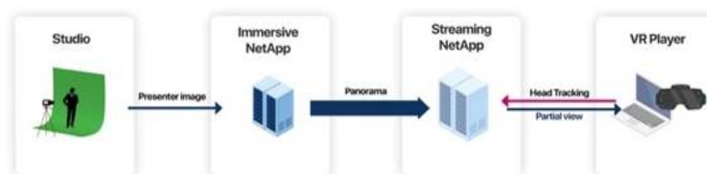
Fig. 2. Scenario 1 workflow

The proposed system setup for this scenario will allow, once in place, to connect remote teachers and remote students in a virtual room where students will be immersed via Head Mounted Displays (HMDs) in the scenario where the teacher provides explanations of a concept, and interactive graphics are used to reconstruct the scene. This scenario raises the possibility of a new type of VR headset that may emerge in the near future, thanks to the continuous evolution of such devices.