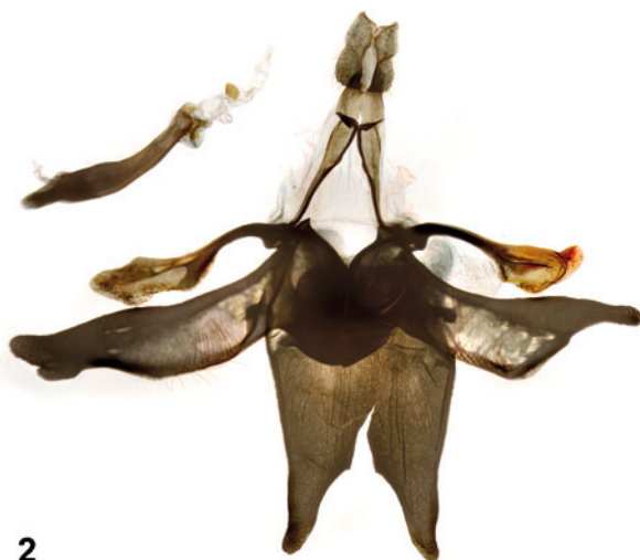
Figs 1, 2. Agdistis iversoni sp. n., holotype: (1) adult; (2) male genitalia, TMSA 15264.

Distribution: South Africa (Northern Cape).