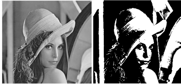
Figure 2. (a) Original image. (b) Image thresholded with Otsu's method.