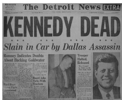
Figure 1. (a) Original image. (b) Image thresholded with Otsu's method.