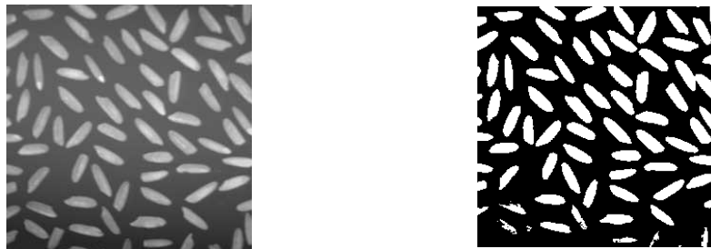
Figure 3.(a) Original image. (b) Image thresholded with Otsu's method.