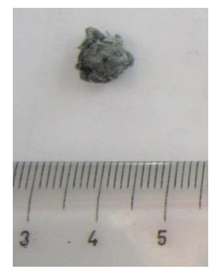
Plastic grain produced according to UNI