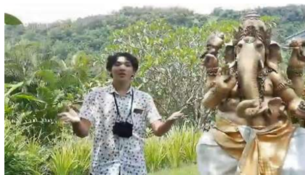
Figure 5. Tourism Destination Introduction by Student