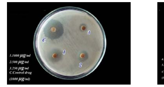
Fig : 1a and 1b shows the antibacterial activity of Methanolic extract of Phyllanthus acidus against Micrococcus flavum .

bottle. Each of these was streaked on to the appropriate culture slants and was incubated at