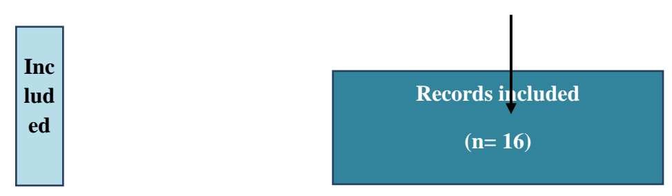
Figure 1:- Flow chart of selection process.

A total of 13 studies (81.25%) were included; all of them were cross-sectional in nature. There were a total of 16 papers included in the systematic review, and their sample sizes varied from 49 to 12,259 individuals, with a median of 455. Eight research (50%) examined parental views on paediatric immunizations in general, while five studies (31.25%) examined views on influenza vaccination (including pandemic H1N1 influenza). Three research (18.75%) focused on participants' opinions and attitudes about various types of vaccinations, such as those for polio and rotavirus.