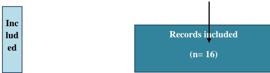
Figure 1:- Flow chart of selection process.

A total of 13 studies (81.25%) were included; all of them were cross-sectional in nature. There were a total of 16 papers included in the systematic review, and their sample sizes varied from 49 to 12,259 individuals, with a median of 455. Eight research (50%) examined parental views on paediatric immunizations in general, while five studies (31.25%) examined views on influenza vaccination (including pandemic H1N1 influenza). Three research (18.75%) focused on participants' opinions and attitudes about various types of vaccinations, such as those for polio and rotavirus.