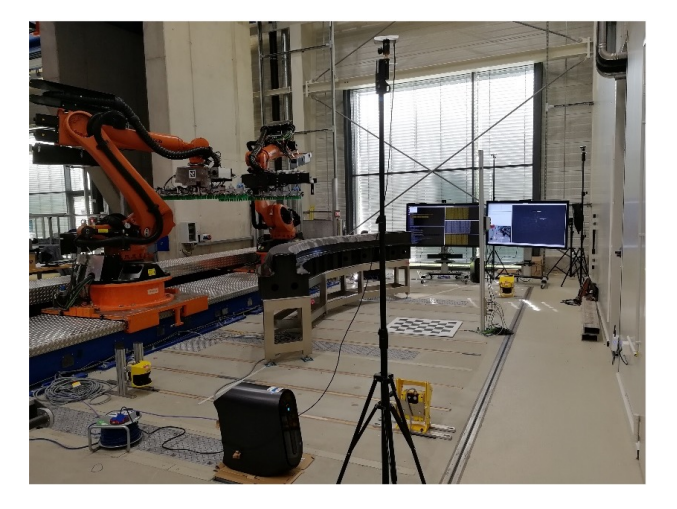
Fig. 2. The two workcells developed in the DrapeBot project. On the left, a workcell for the production of small and medium parts such as in automotive industry; on the right a workcell for large carbon fiber parts production as in the aerospace industry. Both workcells are equipped with a network of cameras.

For production processes involving large carbon fiber parts instead, a large size workcell (i.e., with a footprint of 6.5\times8.5 m) equipped with two industrial robot is proposed; the two manipulators are moved in coordination to assist the human operator during the material transportation to prevent large patches from being deformed or ruined by too high tensions.