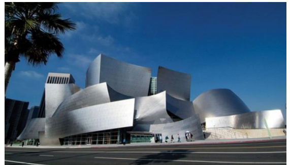
Walt Disney Concert Hall, architect Frank Gehry, Los Angeles.