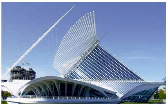
Milwaukee Museum, architect Santiago Calatrava, Milwaukee, USA.

Residential complex in Romainville. Apartments of various types open into the green courtyard, including townhouses with their own garden, apartments in the building with steps-terraces or with access to the roof with trees and space for relaxation (it was created there thanks to the efficient location of engineering equipment). But the most interesting thing is the balconies sheathed with wood on the facades and “tree houses”, terraces at the level of the second floor, where private bridges lead from the apartments. They give life to the whole complex.