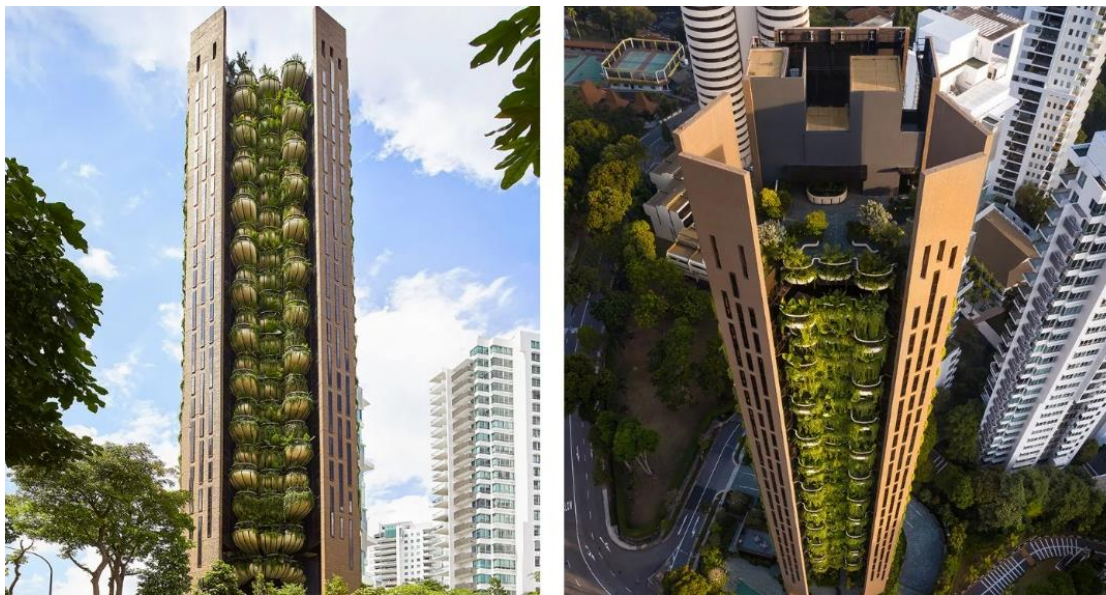
Residential complex Eden. Architect Thomas Heatherwick. Singapore.

An example is the project called Eden, which author Thomas Heatherwick of Heatherwick Studio sees as an alternative to standard glass and steel towers, as well as a desire to exploit the relationship between built and natural environments. Instead of a hermetically sealed box, the designers created an open home paired with organic, lush vegetation to complement the balconies. Residents of the city have already nicknamed the new building the “vertical palace of nature”.