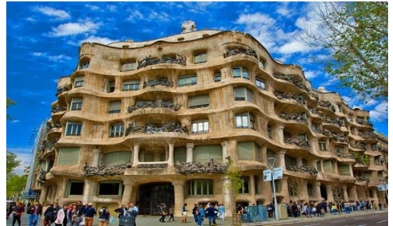
House of Mila, architect Antoni Gaudí, Spain.

Designed by architect Frank Gehry for the Walt Disney Concert Hall in Los Angeles. The heart of one of the world's most sophisticated acoustic venues. The bizarre shape of the building is the sound of an atypical organ expressed in architecture. Adaptation (lat. adaptatio - adapt) - techniques associated with the adaptation of processes, structures, forms, materials to specific environmental conditions. Merging with the environment.