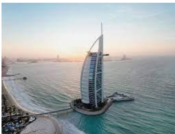
Burj Al Arab Hotel, architect Tom Wright, Dubai, UAE.

Analogy (Greek analogia - correspondence, similarity) - techniques where similarity is used, similarity in some respect of the projected indicators of an object with those already known.