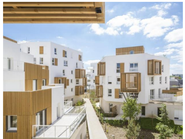
Residential complex in Romainville, architect Brenac Gonzalez, France, Paris.

Fragmentation - (lat. fragmentum - a fragment, a piece) - techniques associated with dividing, splitting and dividing indicators.