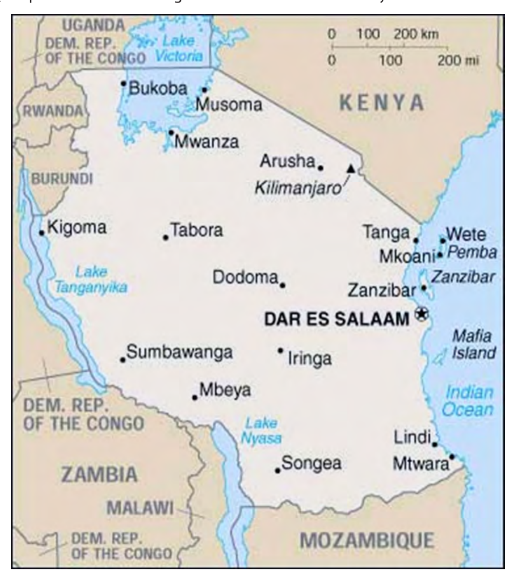
Map N° 1: Map of Tanzania showing the location of the case study

In 2002 Tanzania had a population of around 33.5 million people, of which about 77.5 percent were in rural areas. The Tanzanian per capita Gross Domestic Product (GDP) in 1998 was USD 210, and the rate of GDP growth is estimated to be between 2.7 and 3.5 percent. Dar es Salaam provides around 19-20 percent of the national GDP, although there has been some decline since the 1980s due to the increased importance of the agricultural sector, currently contributing over 60 percent of GDP, and to a decline in urban industrial development. The total urban population of the country in 2002 was estimated at over 7.5 million people, and about 31 percent was placed in the capital city of Dar es Salaam, which has a total area of 1,350 km2. Map No 1 shows the location of Dar es Salaam and other major cities.