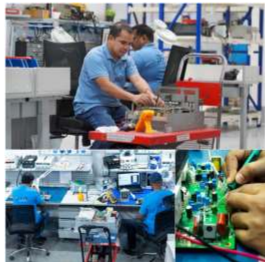
Fig 2. The facility to remanufacture

The facility will receive many different units and some of those units are similar to Fig 3 which is from sectors like Oil & Gas, Water & Energy. This facility will remanufacture more than 1,000 units a year for the Middle East.