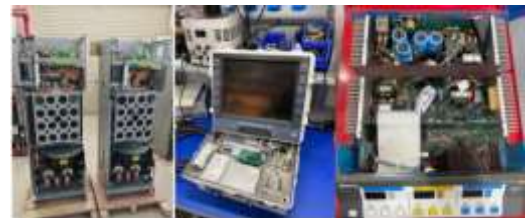
Fig. 3 sectors like Oil & Gas, Water & Energy