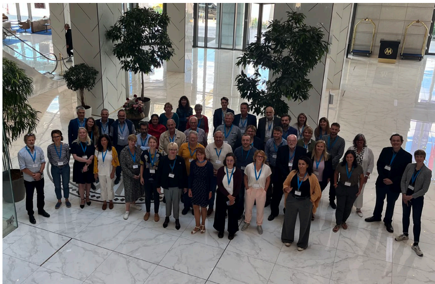
Figure 1: Participants of 3 rd EU-PolarNet 2 General Assembly in Sofia, Bulgaria, 2022.

Rapporteurs: A. Strobel (AWI), F. Pausch (AWI), P. Elshout (EPB)