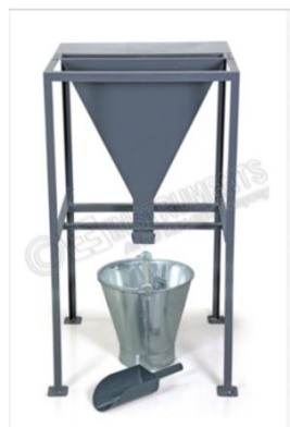
Fig.1:-Typical V- Funnel Apparatus

Slump flow, V-funnel at 5 minutes, L-box tests were performed in the laboratory confirming to EFNARC specifications on fresh SCC mixes to find filling ability, passing ability and segregation resistance.[10]