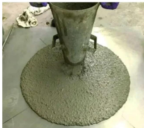
Fig.4:-Collapse slump due to water cement ratio