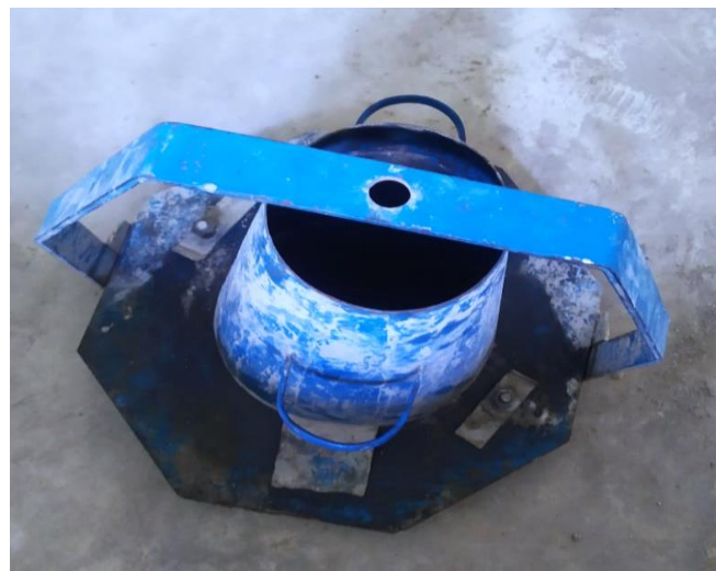
Fig.3:-Typical Slump Cone Test Apparatus