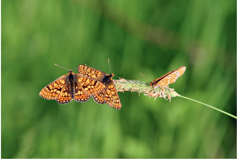
Figure 3. Euphydryas aurinia – Gârbovu, Dealu Mare Monastery (Gorj County). May 9, 2015