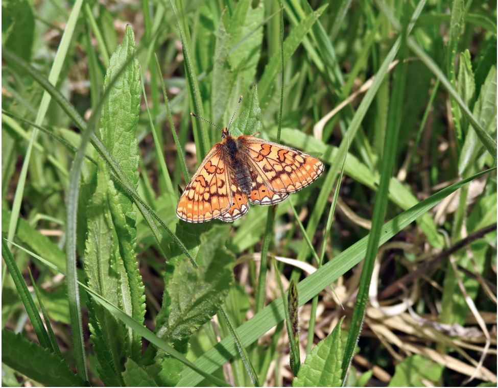
Figure 4. Euphydryas aurinia , female – Goia, Voineasca forest (Argeş County). May 7, 2022; photo Alexandru Iftime.

Together with the large scarce blue Phengaris teleius (Bergsträsser, 1779) these three species also have the largest number of identified breeding areas, with at least 1000 estimated populations within the PBAs. However, very few species have undergone increase of the local populations on PBAs, the maximum being the one of the Marsh Fritillary with five sites (but for 37 sites, the overall reported abundance has decreased, for 71 sites it was found to be stable and for 60 sites, the overall reported abundance was considered unknown – van Swaay and Warren 2006). Given these, the Marsh Fritillary appears as a species with high protective potential at least all over its European range.