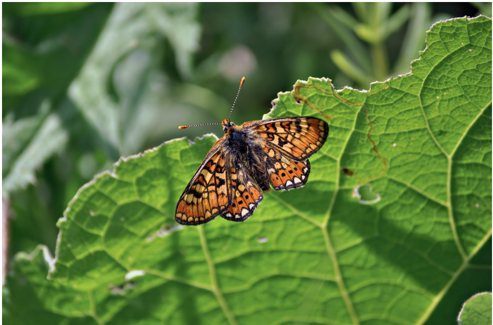
Figure 2. Euphydryas aurinia – Bratovoiești, Pădurea lui Barbu (Dolj County). May 8, 2015