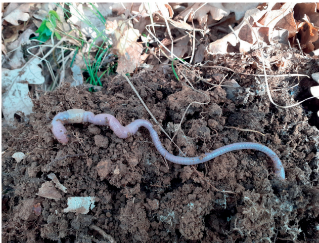
Fig. 2. Living specimen of species Cernosvitovia strumicae in an oak forest on the Western slopes of Kopaonik Mt.