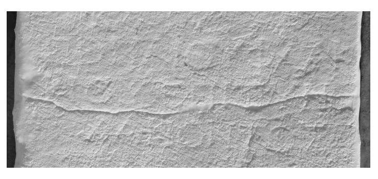
Ποπλίου Φλα-2 ψίου Έπιτυν-<sup>w.</sup> χάνοντος.