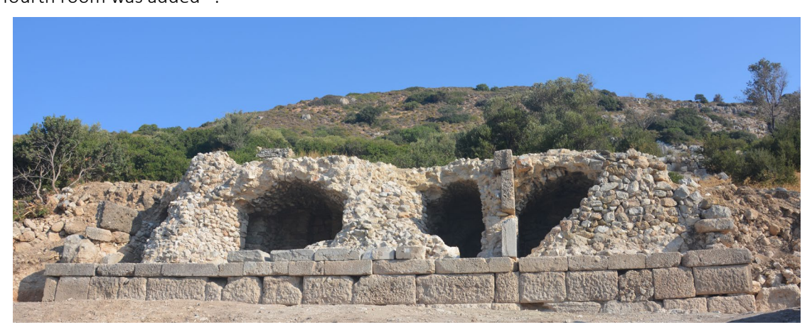
Fig. 2. The monumental vaulted tomb from the south