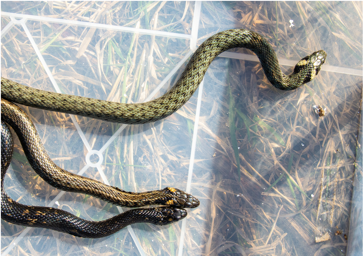
Figure 2. Polymorphism observed in Natrix natrix populations from DDBR. Top common morph; middle double yellow stripes pattern; bottom melanotic morph.