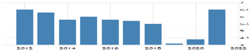
Fig 1.4: Current unemployment rate graph in Pakistan from 2012 to 2022 An intense polarization

condition. It can be increased by more than 50% in future. So the current political crises also bring unemployment challenges to Pakistan which also harms Pakistan’s economy.