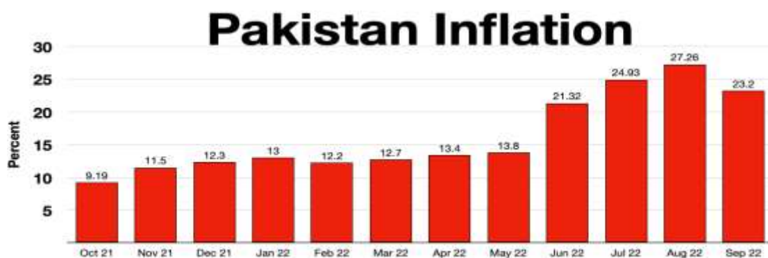
Fig 1.2: Inflation Rate in Pakistan in current circumstances

On the flip side, mostly in Pakistan, the country's economy depends on imports. When the textile industry also grappled with many challenges like the energy crisis, inflation, market uncertainty and volatility, therefore, ultimate people start importing more than normal which will also increase the financial burden of the country's economy. When imports increase, we will need more foreign currency dollars and when business-person withdraw dollar Pakistan currency, the Rupee price will go down and lower. That will also bring economic challenges and problems for the national economy.