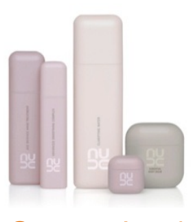
Cosmetics / Packaging