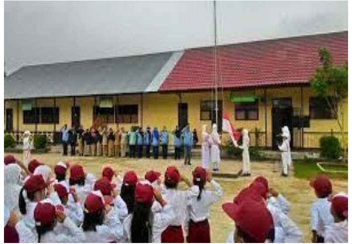
Figure 8. Pancasila Student Profile Value: Independent