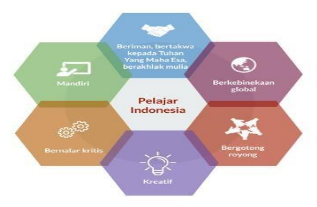
Figure 2. Six Pancasila Student Profiles

This program also aims to train student leadership. Students are used to facing various challenges off-campus and solving problems they get in a new environment. Students can also learn to become educators at school. In addition to increasing literacy and numeracy, this program is also to strengthen the profile of Pancasila students. Pancasila Student Profile is a form of lifelong learning that has global competence and behaves in accordance with Pancasila values, with six main characteristics: faith, piety to God, and noble character, global diversity, cooperation, independence, critical reasoning, and creativity, as shown by the following figure