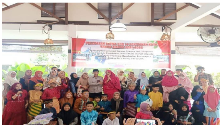
Figure 7. The Value of Pancasila Student Profile: Global Diversity