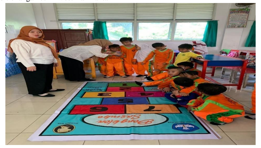
Figure 6. The value of Pancasila Student profile: Creative

The third Pancasila Student Profile value is creative. Students carry out a learning program with traditional games in the form of tabak games. This activity can give students an antusia in participating in learning and be more active.here are pictures of learning using tabak games or traditional games in West Kalimantan