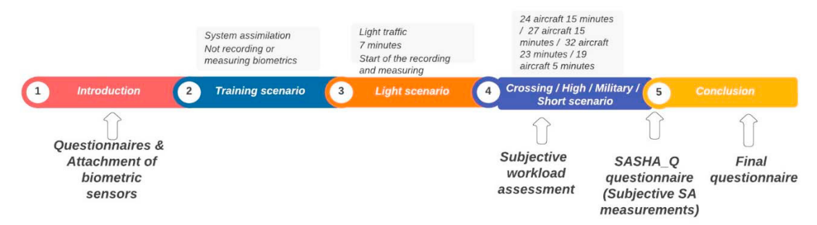
Fig.2. Human-in-the-loop experiment flow diagram

The sequence of the experiment activities is shown in Fig.2 All ATCOs firstly did a training scenario where they could notice if they have system issues and assimilate with the experimental environment. The training scenario was followed by a light traffic scenario. The purpose of this scenario is to enable independent performance while traffic count being low. The Light scenario lasted 7 minutes and included 19 aircraft. All the other scenarios were designed based on real traffic situations and were performed in random order. Some traffic, with consulting SME, was implemented deliberately to create conflicts.