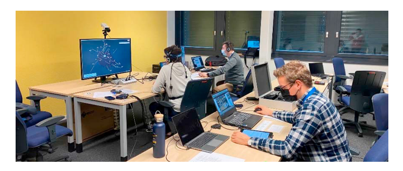
Fig.1. ESCAPE Light simulator platform ATCO interface

Since there was only an executive position without a planner, no coordination with neighboring sectors was possible. Furthermore, all working tasks of the planner were performed by the executive. In order to achieve a more realistic traffic situation, the incoming traffic before the sector boundary cannot be issued with flight level (FL) change instruction but could be turned. This adaptation was necessary because more direct routes are preferred, they reduce the excessive flown distance but can also resolve a conflict. While performing the exercises ATCOs were asked in regular intervals about their workload level.