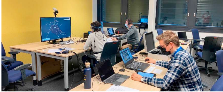
Fig.1. ESCAPE Light simulator platform ATCO interface

Since there was only an executive position without a planner, no coordination with neighboring sectors was possible. Furthermore, all working tasks of the planner were performed by the executive. In order to achieve a more realistic traffic situation, the incoming traffic before the sector boundary cannot be issued with flight level (FL) change instruction but could be turned. This adaptation was necessary because more direct routes are preferred, they reduce the excessive flown distance but can also resolve a conflict. While performing the exercises ATCOs were asked in regular intervals about their workload level.