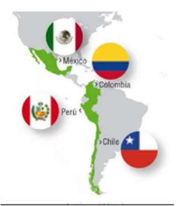
Figure 1 – Map of member countries, Pacific Alliance

These countries have strong trade relations between Europe, North America and Asia, as all members have free trade agreements with the United States and European Union. Chile, Mexico and Peru are part of the Asia-Pacific Economic Cooperation (APEC), as well as the Trans-Pacific Partnership Agreement (TPP) [11-18].