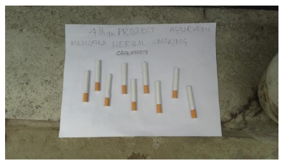
Fig 3d. Finished cigarette containing herbal smoking ingredients

ailments. This therapy is very helpful with removing mucus in the body, and treat the ailments such as wet cough, bronchitis and asthma caused by mucus. The human sinus is a marvelous sound box of nature that is responsible for maintaining air conduction, known in the name of sinus. The sinus is lined by a thin layer of mucus cells which always secrets some lubricants with the help of some chemical mediators like histamine, leucotreine, etc. In disease condition like rhinitis (Pratisyaya), coryza (Pinasa), common cold (Kasa), etc. the mucous layer become inflamed and causes irritation. The disease condition can be detected by skiagraphy of PNS. <sup>13</sup>