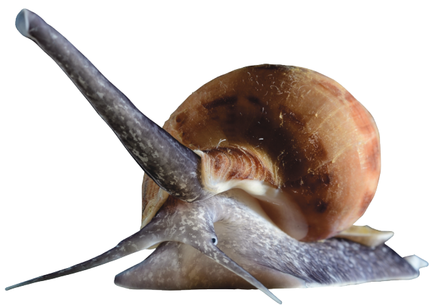
A large sea snail (family Buccinidae ), probably a new species , collected from hydrothermal vents on the Reykjanes ridge, North Atlantic Ocean.

We call on all decision makers to recognize the importance and value of all deep-sea species, to ensure their consideration in aims to halt global biodiversity loss, and to prioritize the conservation of the deep sea. Effective management and conservation of the deep sea will benefit global ocean health by preventing the loss of hundreds of thousands of valuable and amazing species, before they are driven to extinction as a direct result of the activity of our own species. To provide the scientific basis for this critical task, we urge decisions makers to establish and endorse international collaboration in deep-sea exploration and the discovery and description of species for the conservation of the World's last great wilderness.