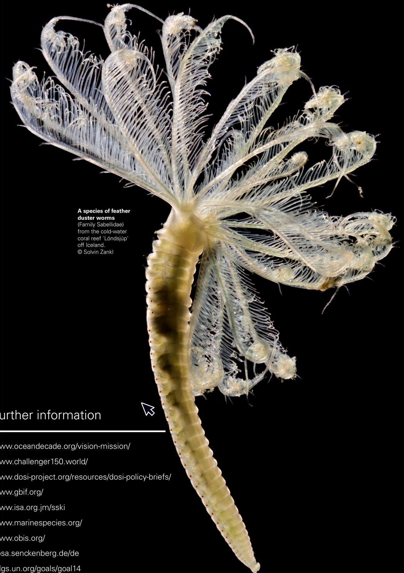
A species of feather duster worms (Family Sabellidae) from the cold-water coral reef 'Lónðsjúp' off Iceland.