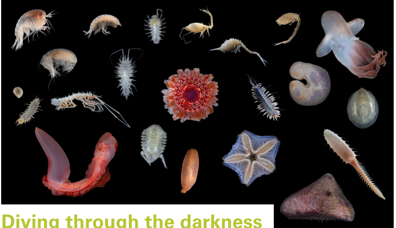
Above: Diversity brought to light during a single deep-sea sampling campaign - the recent Aleut-Bio expedition to the Aleutian Trench on board RV Sonne (species not shown to scale).