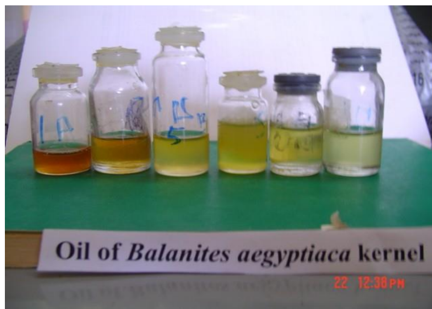
Figure 3: Shows oil extracted from Balanites aegyptiaca Kernel

Protein was determined in the defatted kernel after oil extraction. It ranges between 49.65% (oval fruit) and 53.8% (oblong fruit), with a mean of 52.11% and was significantly different between shape (Table 3). The obtained protein percentages were higher in comparison with 27.5%, 26 to 30%, 32.4% and 38.7 to 41.2% values given by 15,20, 24, 25,20 respectively. But still, these protein values obtained in the current study were not considerably different from that range of 49-51% (after oil extraction, before extraction was 27%) given by 22 and 50% reported by 14 . The high protein percentage is an advantage of Balanites kernel cake, which is used for human and animal nutrition.