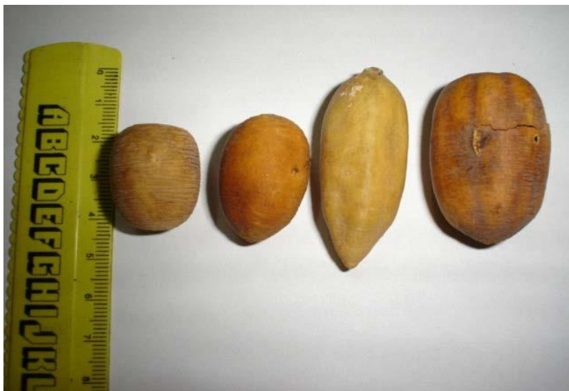
Figure 1: Shows the different shapes of Balanites aegyptiaca fruit (Spherical, oval, elongate & oblong shape)

EW: Weight of fruit without epicarp and mesocarp.