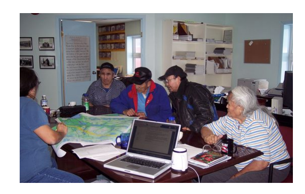
Using oral histories, Indigenous Knowledge and Local Knowledge for monitoring environmental change in Canada