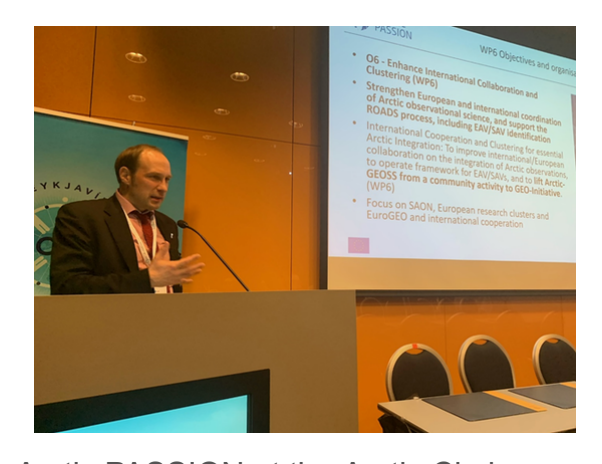
Arctic PASSION at the Arctic Circle