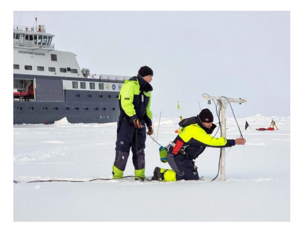
Observing Arctic sea ice in Arctic PASSION