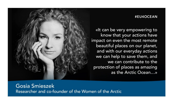
Arctic PASSION on the EU4Oceans podcast