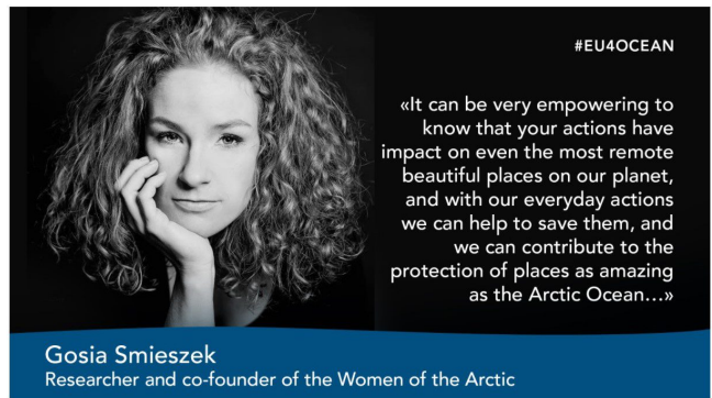
Arctic PASSION on the EU4Oceans podcast