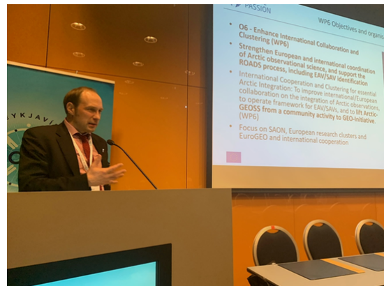
Arctic PASSION at the Arctic Circle