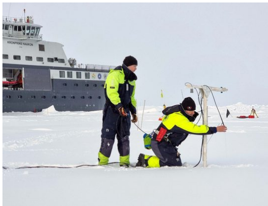
Observing Arctic sea ice in Arctic PASSION