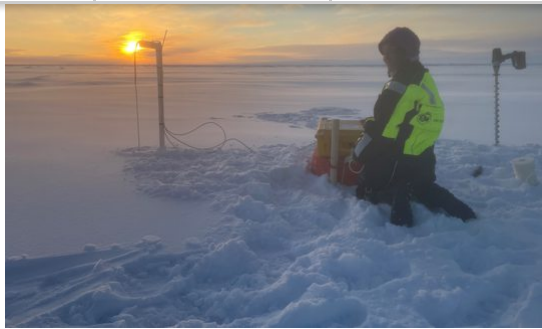
CNRS Paris deployed instruments for Arctic sea ice monitoring