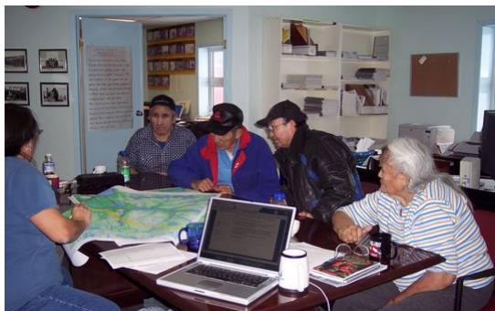
Using oral histories, Indigenous Knowledge and Local Knowledge for monitoring environmental change in Canada