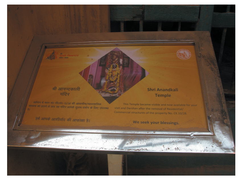
Figure 4. A sign board placed next to a 'rediscovered temple', February 2019, picture by author.

movement, told me that buildings had been constructed around temples to protect deities from the raids of Muslim invaders. If it wasn't for us, he said repeatedly, Banaras would not be known as the city of temples, but as the city of mosques! Soon, this became a popular narrative among evicted residents and encroachment was thus reappropriated as a kind of heroic gesture, very much in line with mainstream Hindu nationalist narratives about Muslims as temple desecrators.