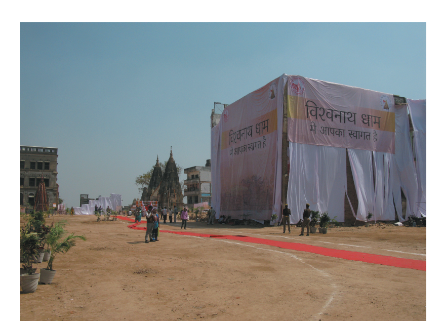
Figure 1. The area on the inauguration day, 8 March 2019.