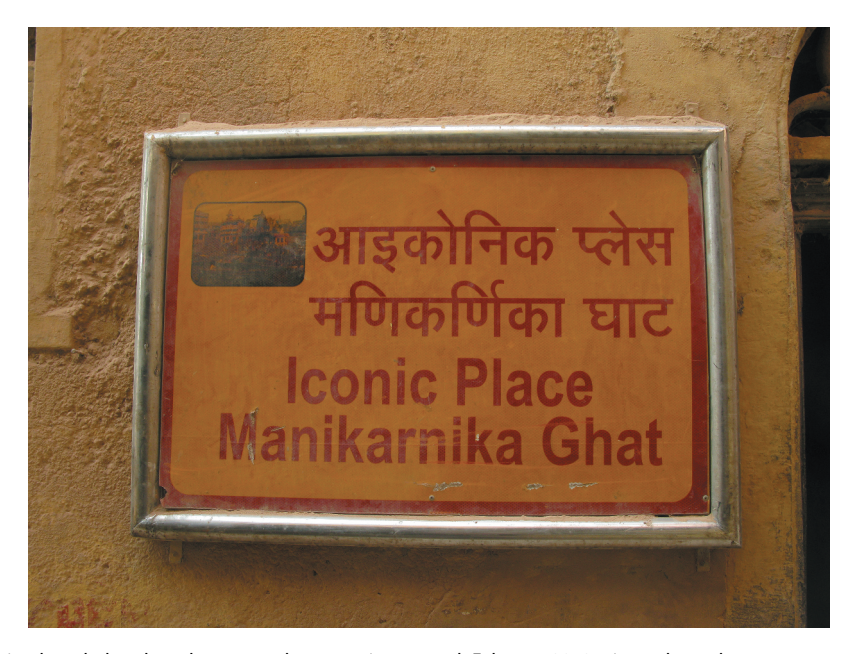
Figure 3. A sign board placed on the way to the cremation ground, February 2019, picture by author.

sanctioned it irrevocably. Press reports about heritage initiatives connected to the Corridor and the revival of 'the old glory of Banaras' began to appear regularly. <sup>44</sup>