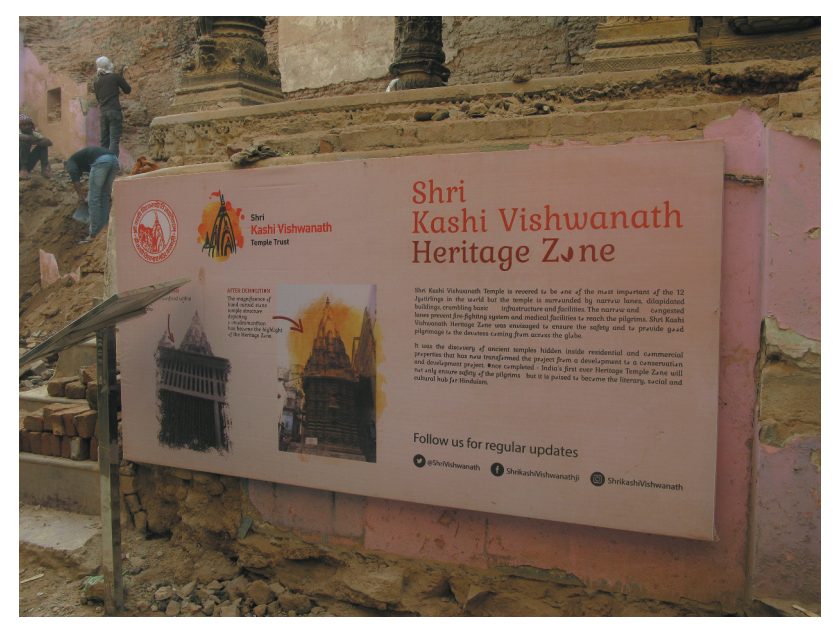
Figure 2. Work in progress and new sign board for the 'heritage zone', February 2019, Picture by author.