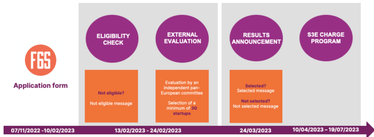
Figure 2. S3E Charge timeline

Below are presented the expected dates for the different stages. The opening and closing dates of each stage can be subject to change in case of any modifications in the project's schedule.