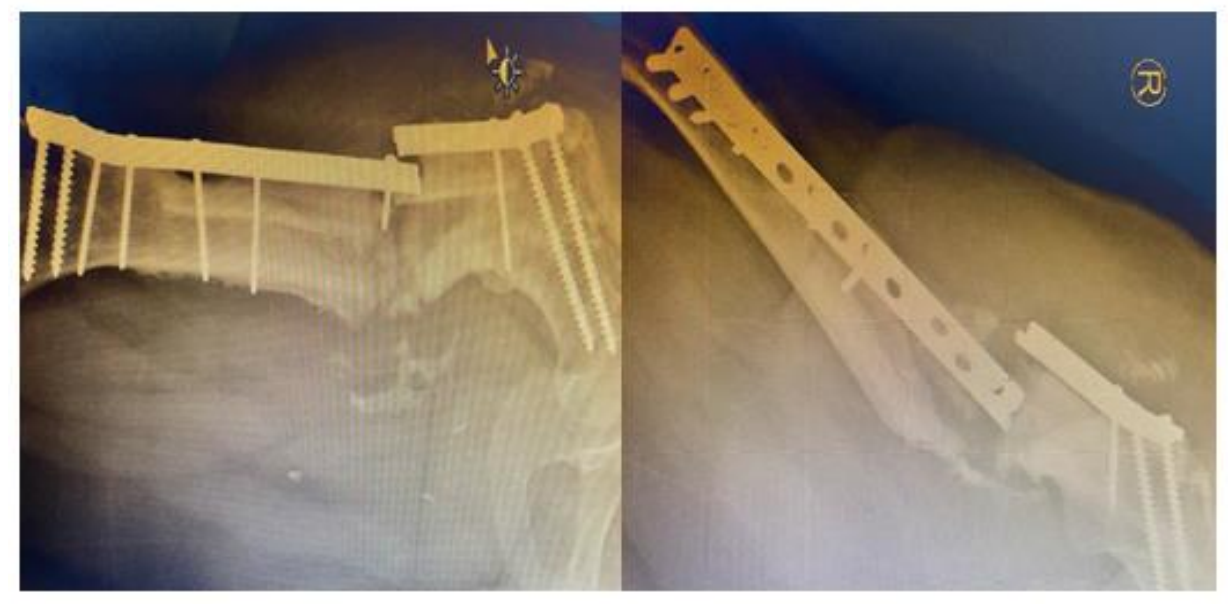
Figure 5: X-ray scan showed broken plate and fibula graft.