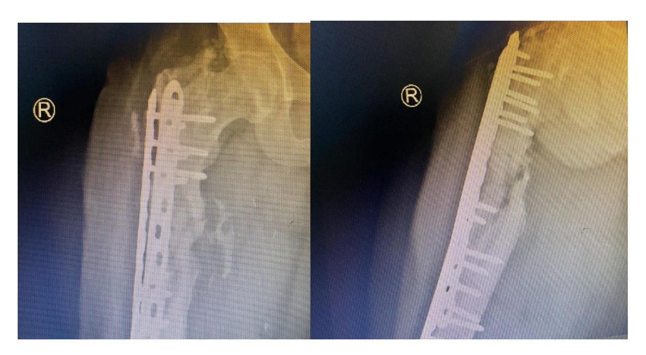
Figure 6: X-ray showed application of double plate for right femur fracture and the fracture showed callus formation.