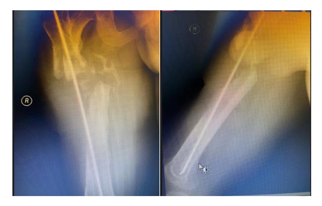
Figure 2:x ray showed right femur insertion of intramedullary tens nail with antibiotic.