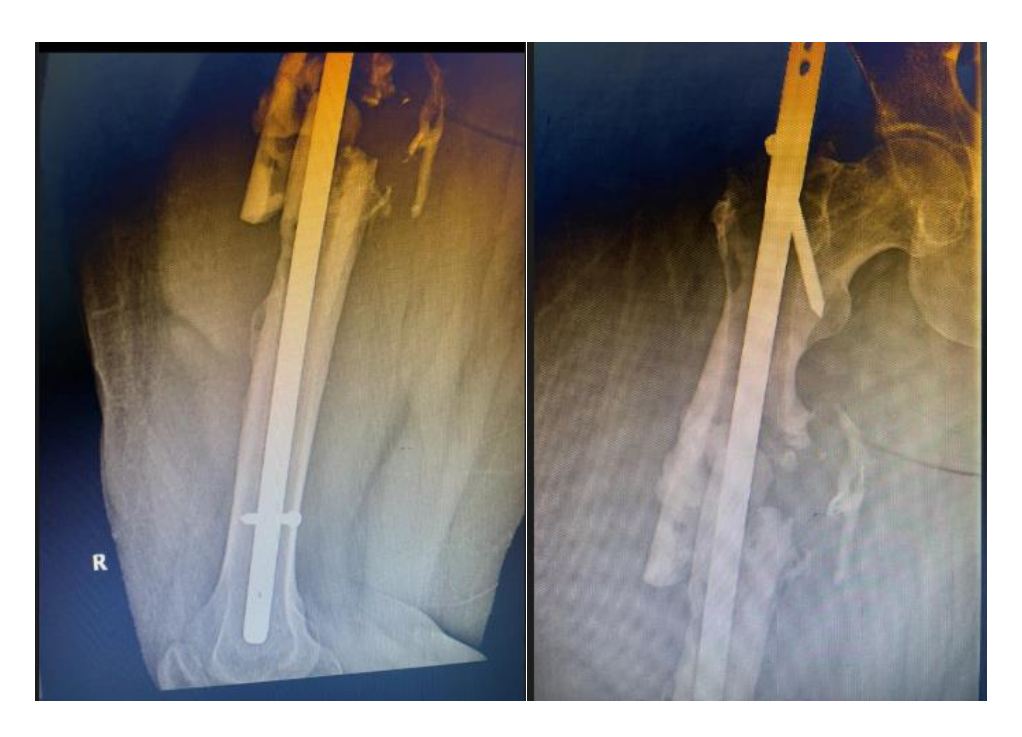
Figure 1: The x-ray showed non-union femur fracture fixed by intramedullary nail .