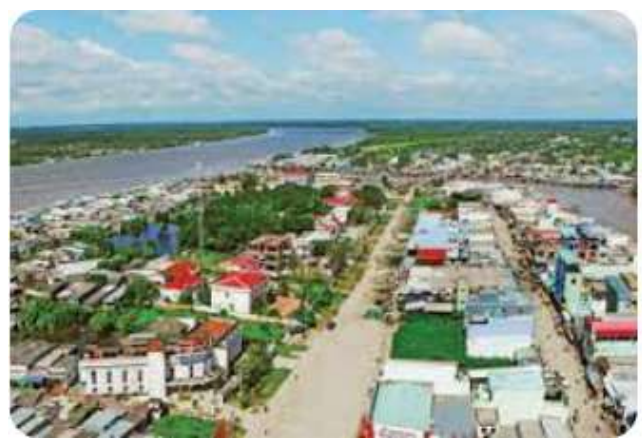
Figure 2: Ca Mau focus on industrial zone