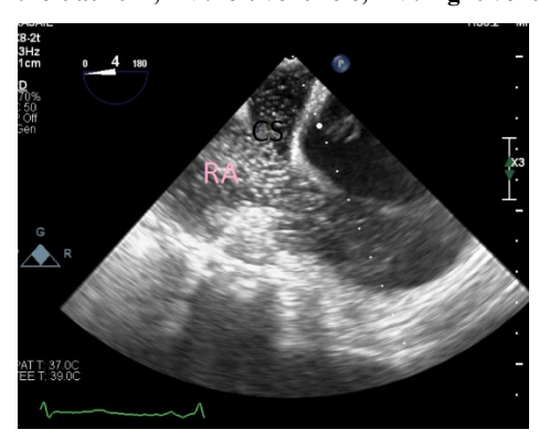
Figure 3. The image shows the drainage of the dilated coronary sinus into the right atrium in contrast study.

(LA: left atrium, LV: left ventricle, RV: right ventricle)