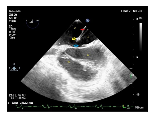
Figure 1. Transesophageal echocardiography shows an enlarged left atrium, a dilated coronary sinus (red arrow), a membrane-like structure (yellow arrow), and moderate stenosis along the dilated coronary sinus (blue arrow).

There was also a severely dilated CS, indicating the drainage of a PLSVC into the CS with turbulent flow