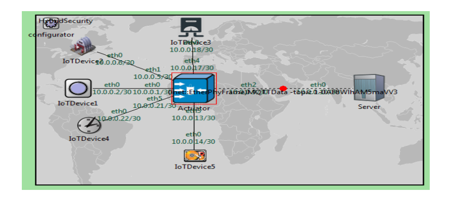
Figure 2. The encapsulated image file upload from the actuator to the server