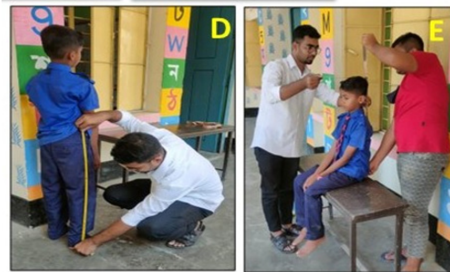
Figure 2 (D-E): Procedure of collecting data of natural physical growth (D= Leg Length, E= Sitting Height)