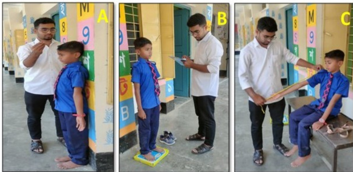
Figure 1 (A-C): Procedure of collecting data of natural physical growth (A= Standing Height, B= Body Weight, C= Arm Length)