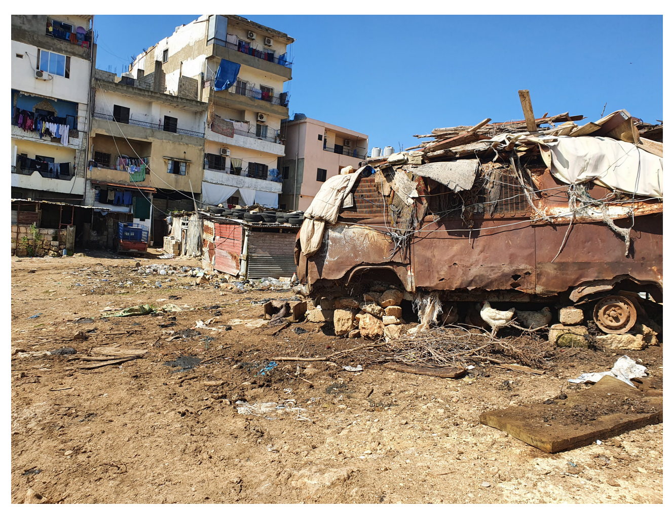
Improvised chicken coop next to an informal area in al-Qubbeh. February 2020.