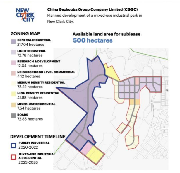
Figure 2. Zoning Map and Development Timeline of CGGC in New Clark City in building a mixed-used industrial park. Figure is taken from BCDA's 2021 Primer (2021b, p. 8).

However, in the 2022 primer, the name CGGC is no longer seen (BCDA, 2022b). Moreover, there is no mention of CGGC's involvement in New Clark City in the BCDA's annual reports from the start of China's DSR in 2015 to 2021 (BCDA, 2015, 2016, 2017, 2018a, 2019, 2020, 2021a). The rest of the Chinese investments in the smart city are, first, the Subic-Clark Cargo Railway Project under China Communication Construction Co. Ltd, which was postponed (BCDA, 2016, p. 24; Pitlo, 2022). The railway project is envisioned to transform Central Luzon – the location of New Clark City – into a total logistics hub. There are talks about having the project revived. The second is Huawei's Safe City Solutions project, which BCDA has no longer mentioned since the 2017 annual report (BCDA, 2016, p. 25, 2017, p. 55).