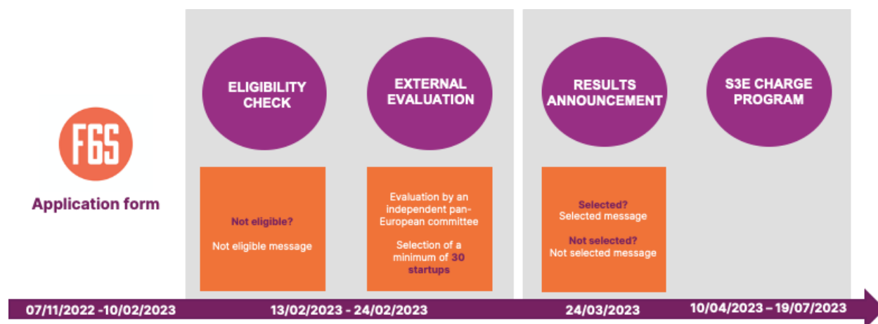
Figure 2. S3E Charge timeline

Below are presented the expected dates for the different stages. The opening and closing dates of each stage can be subject to change in case of any modifications in the project's schedule.