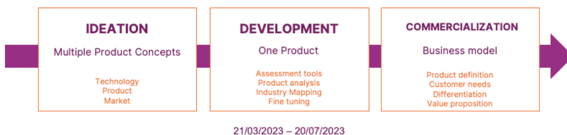
Figure 2. S3E Start program approach

The diagram below provides a more detailed look into the three phases of the S3E Start process: