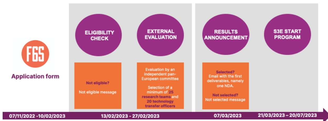
Figure 3. S3E Start timeline

Below are presented the expected dates for the different stages. The opening and closing dates of each stage can be subject to change in case of any modifications in the project's schedule.