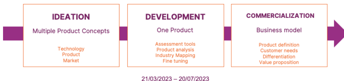
Figure 2. S3E Start program approach

The diagram below provides a more detailed look into the three phases of the S3E Start process: