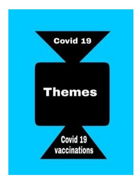
Figure – 1 Showing of broad themes of the results

Awareness about the Covid-19 among the participants: People were quite aware of Covid-19 illness, about where it started, how it spreads, what sort of symptoms it can cause, but as of now they don't believe it's not that lethal as they previously thought, they feared the virus during the first and second waves but are relatively unfazed now. While a similar study done to gauge the perception of Indians found mixed reactions towards the vaccine [10], although the awareness was good in both the cases people didn't really welcome the vaccine here in this tribal population.