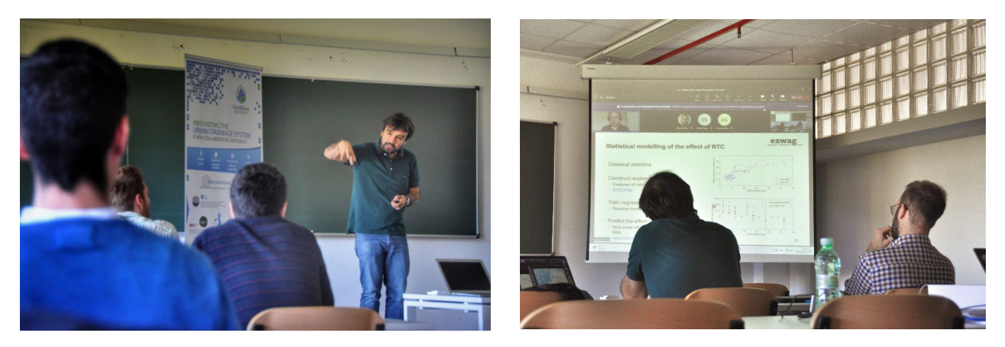
Figure 2. 1<sup>st</sup> Co-UDlabs internal early-stage researcher seminar

The next training events for early-stage and junior researchers are planned to take place in 2023 and 2024, as follows: