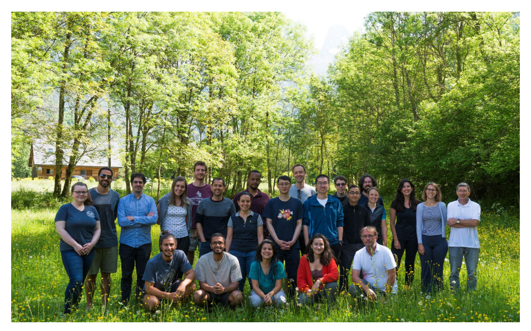
Figure 1. EJSW 2022 in St Maurice en Valgaudemar

The EJSW benefitted from favourable weather for outdoor hands-on sessions and was a great opportunity for sharing knowledge and experience, networking and creating links between participants, reinforced by recreational activities. The flyer of the event is available in Annex 2. More information is available on the project website (<u>https://co-udlabs.eu/2022/05/26/25th-ejsw-2022/</u>).