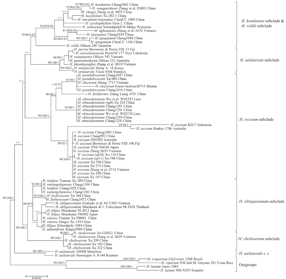
Figure 3. Maximum likelihood phylogeny based on the concatenated plastid DNA sequence dataset. Maximum parsimony and Bayesian analyses recovered identical topologies with respect to the relationships among the main clades of the paleotropical Hymenasplenium . For each node, the following values are provided: maximum parsimony bootstrap (%) / maximum likelihood bootstrap (%) / and posterior confidence (p-value). Columns on the right refer to the subclades described in Xu et al. (2018a). Outgroup taxa are shown as a sister to the paleotropical Hymenasplenium .

The H. excisum subclade recovered in paleotropical Hymenasplenium included several well-supported lineages but represented only four described species (Fig. 3). One lineage (BS = 92%, BS = 98%, BI p = 1) was comprised of accessions identified as H. obscurum and H. pseudobscurum . This lineage formed a separate clade with