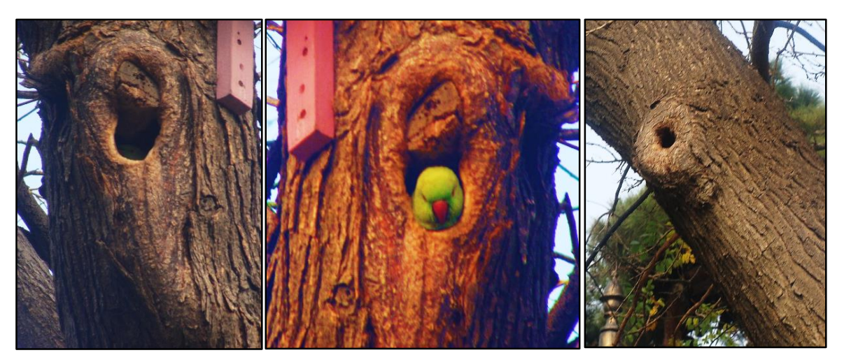
Fig. 2. Nests built and used by RRP on various trees.

Factors providing adaptations of rose-ringed parakeet (Psittacula krameri) in the urban ecosystems