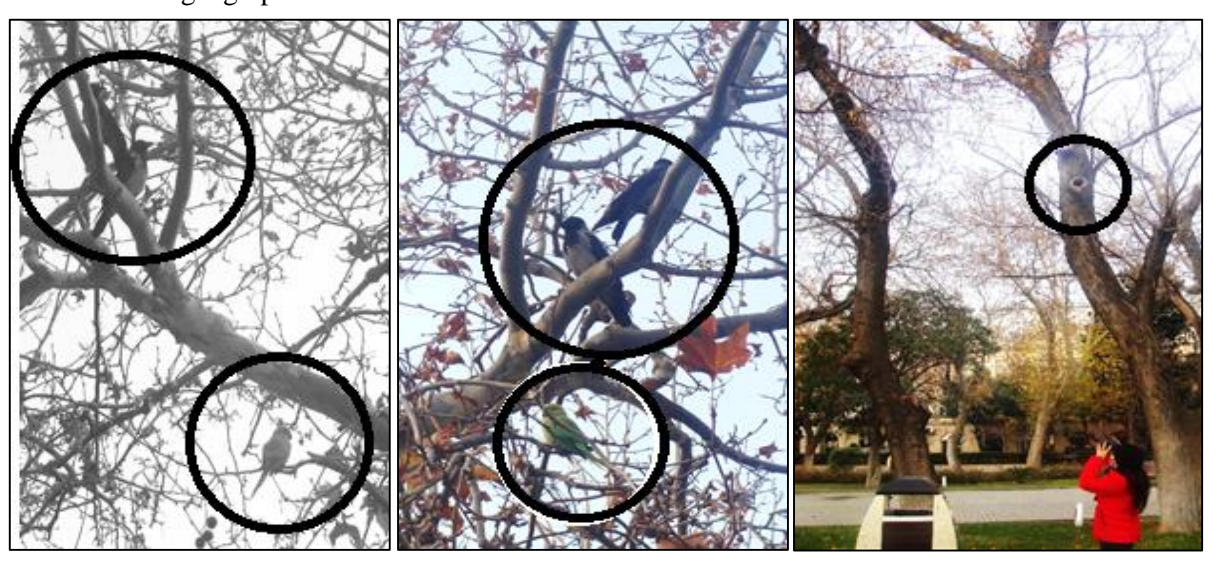
Fig. 3. There was no feed competition between RRPs and Hooded crow (Corvus cornix) on the same tree.

Currently, the domestic population of this species has been formed in Baku. RRP is a new species in the Azerbaijani ornithofauna. Therefore, it is of great importance to predict the impact and role of RRP as an invasive species in the biodiversity of Azerbaijan. In order to clarify this issue, let's pay attention to the numerical dynamics and dispersion of the RRP population.