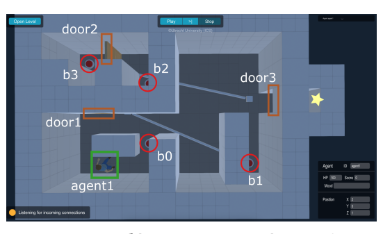
Figure 1: Level buttonDoors in Lab Recruits.

The rest of the paper is organised as follows: Section 2 introduces the running example used throughout the paper. Section 3 presents the background concept, Section 4 shows our proposed