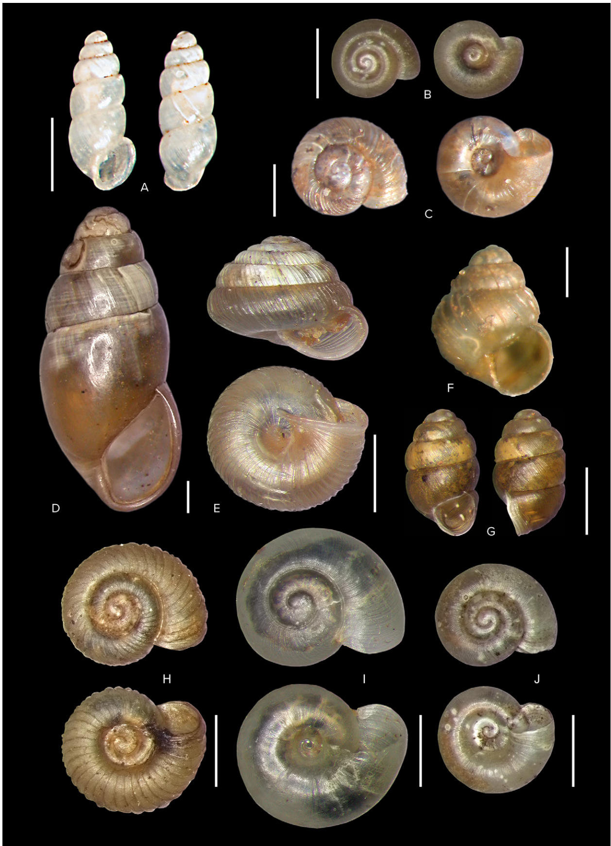
Figure 2. Some leaf-litter dwelling microsnails of Prince Edward Island. A. Carychium exile from South Melville Road, Brookvale, Queens County (NBM-009889). B. Punctum minutissimum from South Melville Road, Brookvale, Queens County (NBM-009895). C. Discus whitneyi from East Point Road, Kings County (NBM-009862), not fully grown. D. Cochlicopa lubrica from Brudenell Provincial Park, Kings County (NBM-009869). E. Strobilops labyrinthicus from South Melville Road, Brookvale, Queens County (NBM-009888). F. Zoogenetes harpa from Mickle Macum Road, Bear River/St. Margaret's, Kings County (NBM-009844). D. Vertigo cristata from Selkirk Road, Queens County (NBM-009887). All scale bars = 1 mm.