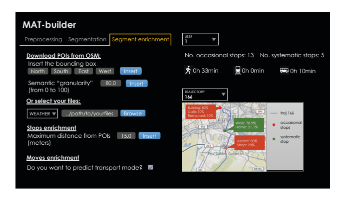
Fig. 3. MAT-BUILDER UI: segment enrichment step

The user will finally proceed to the segment enrichment tab (Figure 3), where they will be able to enrich the stop and