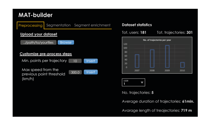
Fig. 2. MAT-BUILDER UI: pre-processing step

Demo attendees will be able to interact with the system through the MAT-BUILDER's UI at the different steps of the enrichment process. The UI presents three tabs corresponding to the three backend modules. In the pre-processing tab (Figure 2) the attendee will be able to select and input the raw trajectory dataset they intend to enrich. Here the pre-processing tab lets the user customize some of the pre-